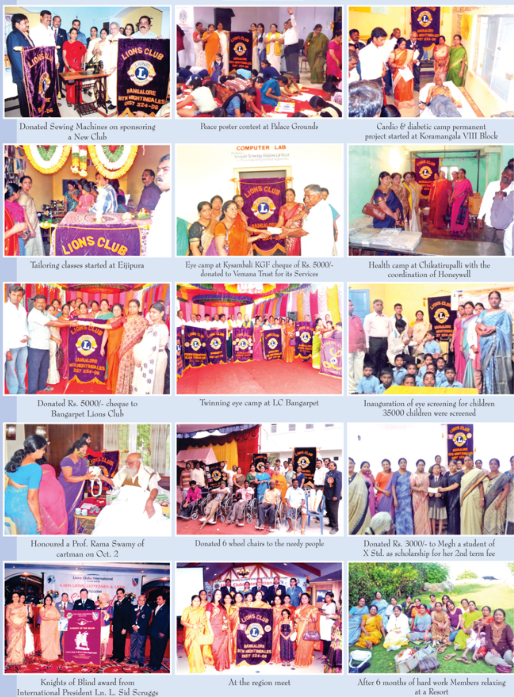
Donated Sewing Machines on sponsoring a New Club